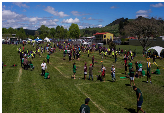
Te Kawau Mārō o Maniapoto Festival October 2016